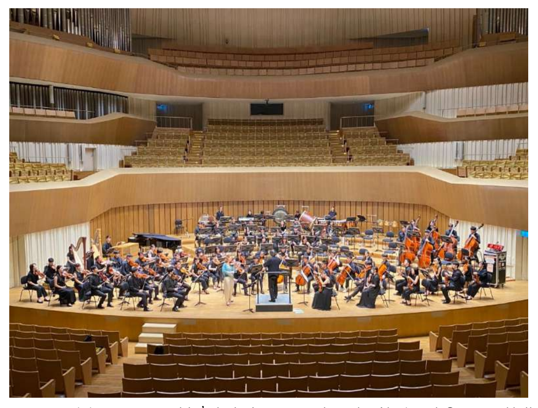
Even as musicians, we couldn't help but marvel at the National Concert Hall in Taipei and the National Kaohsiung Center for the Arts (Weiwuying).