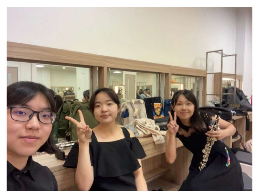
Some of the new friends I made at orchestra camp.