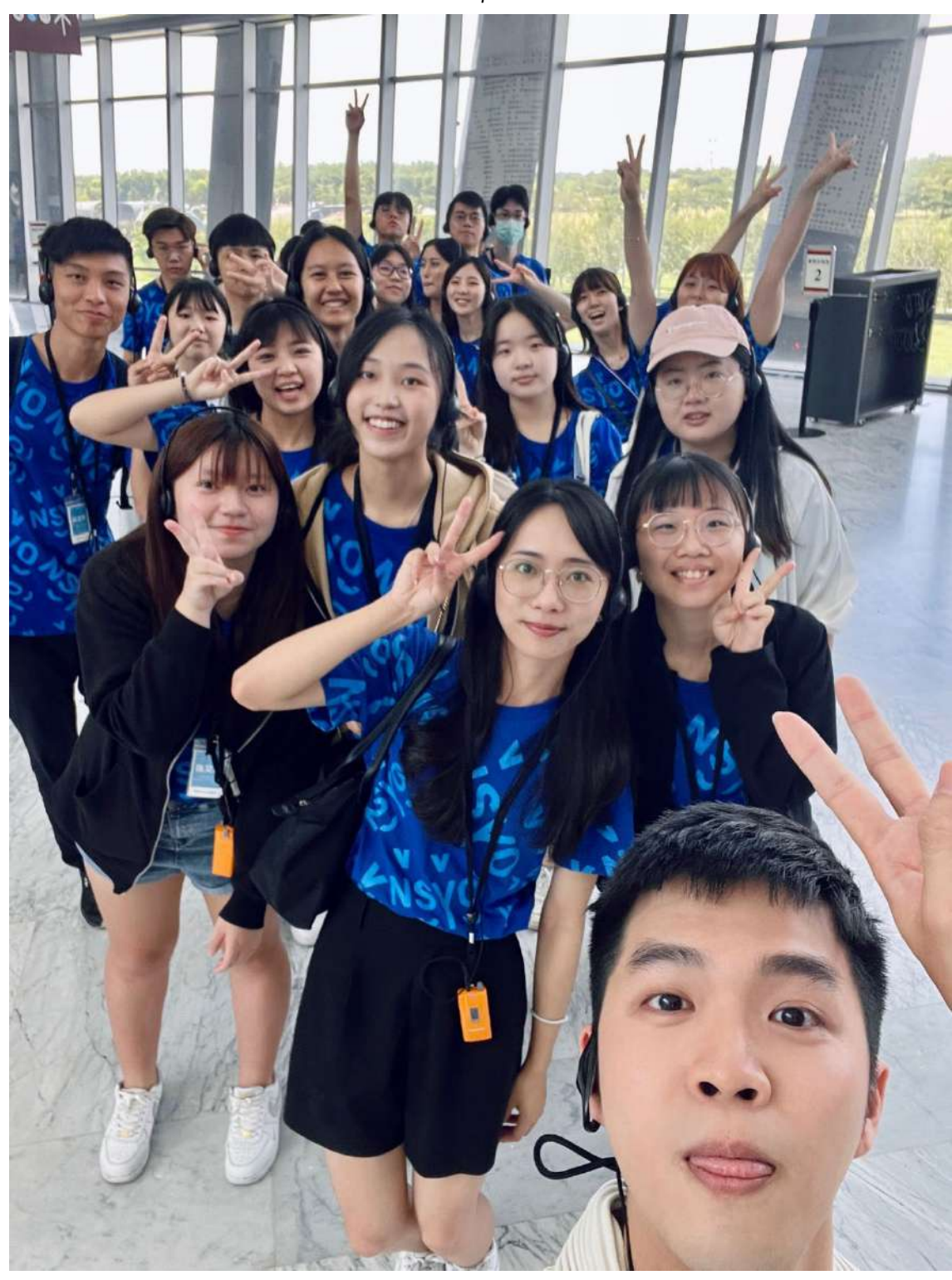
Group tour at the National Palace Museum (Southern Branch). Our guided tour was only available in Mandarin so I helped the Japanese students from our camp translate what the audio guide was saying into English. :)