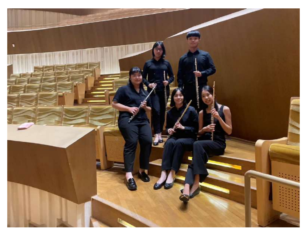
The flautists I met and performed with at NSYO. :)