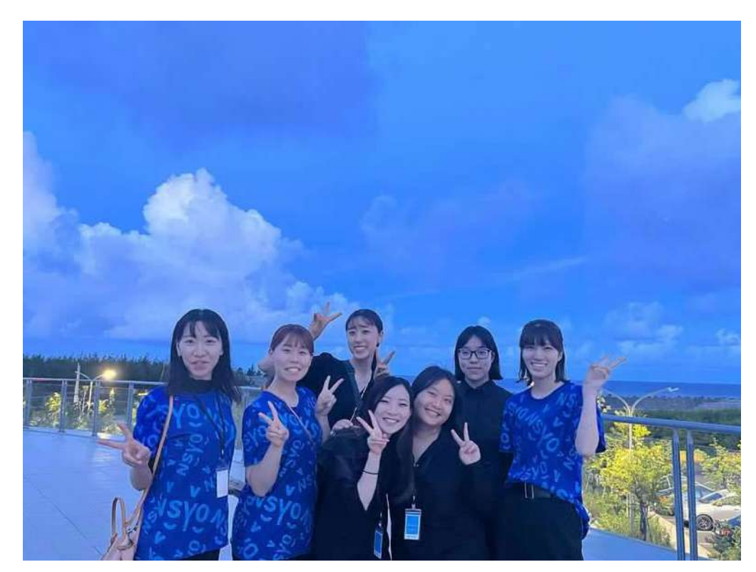
We also made friends with the five Japanese participants!