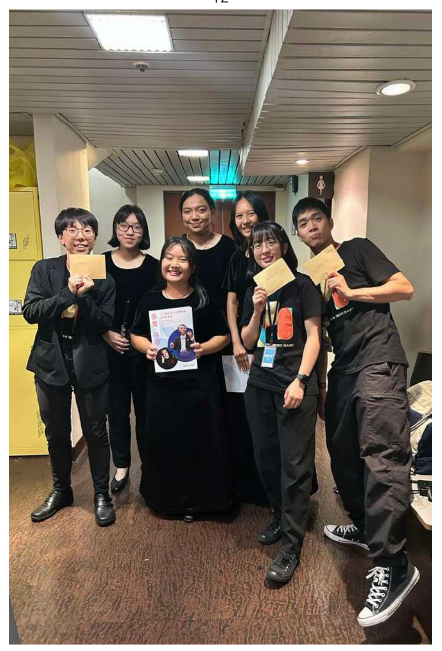
Thank you cards that we stayed up until 3am to write that we wrote at the end of the trip to show gratitude to our camp counselors who took care of us every step of the way.