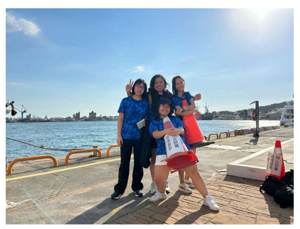
Bonding time with the four of us from SNYO while walking along Banana Pier.