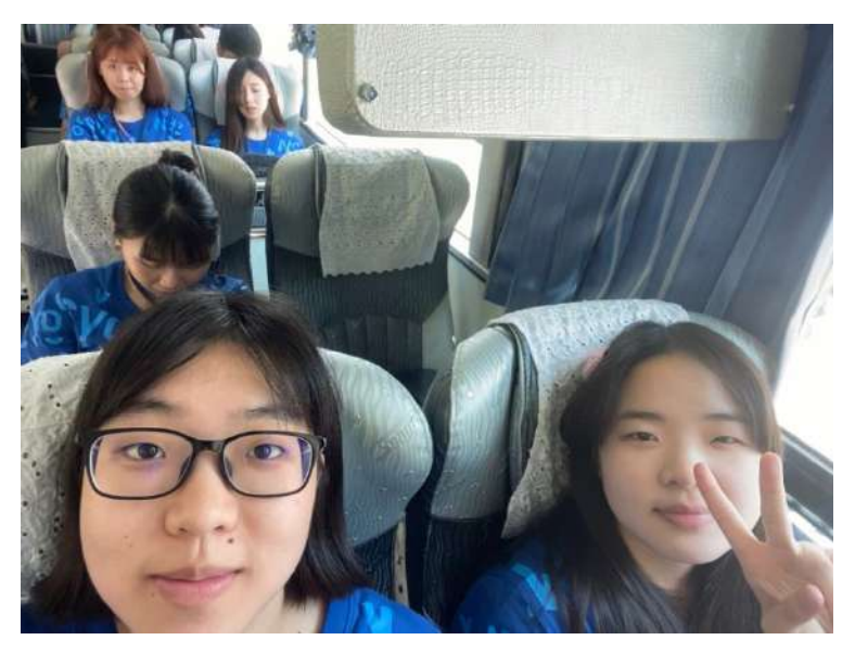
We travelled everywhere by bus, in and out of concert halls and between hotels (except for one time when we took the train from Kaohsiung to Taitung).